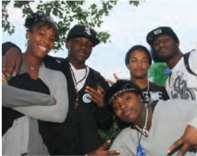
▲ Youth Peace Empowerment Participants